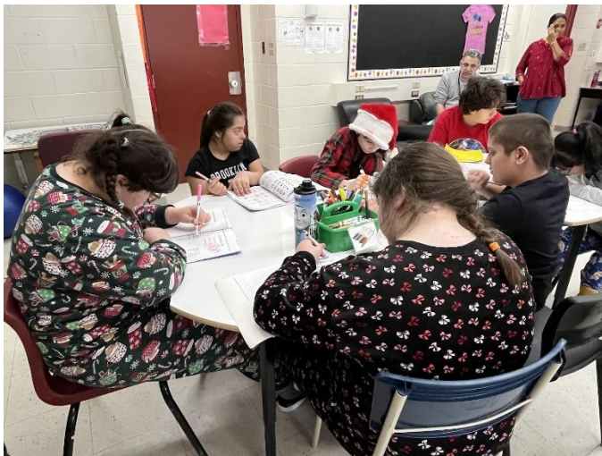
PJ Day and Twin Day

Student Council planned spirit days during the last week of school before the break. They also organized a door decorating competition which allowed students and staff to show off their creativity!